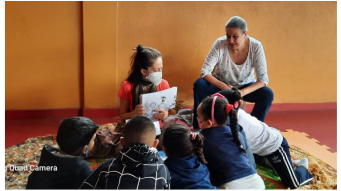
June 30, 2022.

The children who were between six and seven years old organized themselves better raising their hands to speak and addressing the