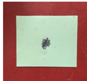
The cat and the bird

Finally, as the Brazilian poet Manoel de Barros said, a child is able to listen to the color of birds. And we adults must reconnect with such listening to the world to understand what the child is telling us.